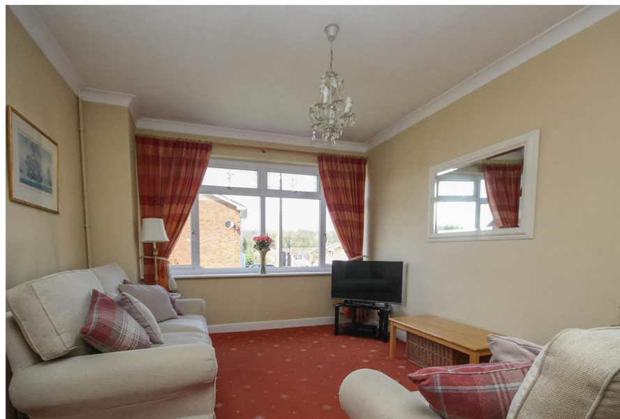
11 Tern Way, Brentwood, CM14 5NY

GROUND FLOOR APPROX. FLOOR AREA 405 SQ.FT. (37.6 SQ.M.) 1ST FLOOR APPROX. FLOOR AREA 413 SQ.FT. (38.4 SQ.M.) TOTAL APPROX. FLOOR AREA 818 SQ.FT. (76.0 SQ.M.) THIS PLAN IS FOR ROOM IDENTIFICATION ONLY, AND ITS ACCURACY IS NOT GUARANTEED. www.epcsinsex.co.uk Made with Metropix ©2021